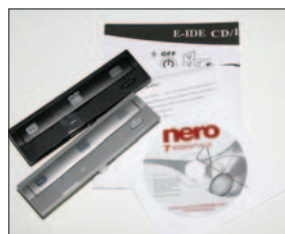
Bundled faceplates and Nero software